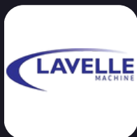
Lavelle Machine Healthcare | 2025

Complete Plexus Portfolio available at www.plexuscap.com/portfolio