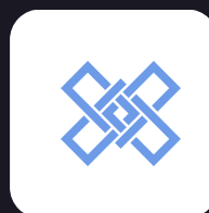
Software Provider Technology | 2025