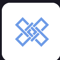
Lawncare Services Provider Residential Services | 2025