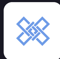
Water Equipment & Supply Industrials | 2025