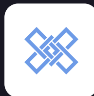
IT Managed Services Provider Commercial Services | 2025