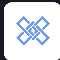
Green Summit Landscape Group Commercial Services | 2025